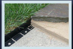
or Natural Stone...